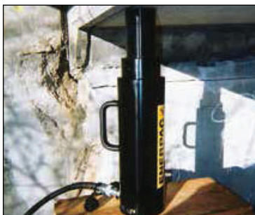
◀ The portable lock nut cylinder RACL-1506 used for extended load supports during epoxy injection for bridge reinforcement.